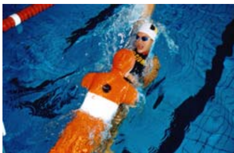
100 m RESCUE MEDLEY

The competitor swims 50 m freestyle to turn, dive, and swim underwater to a submerged manikin located at 17.5 m distance for men and women. The competitor surfaces the manikin within the 5 m pick-up line, and then carries it the remaining distance to the finish edge of the pool.