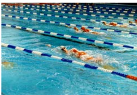
100 m MANIKIN CARRY WITH FINS

The competitor swims 50 m freestyle wearing fins and then dives to recover a submerged manikin to the surface within 10 m of the turning edge. The competitor carries the manikin to the finish edge of the pool.