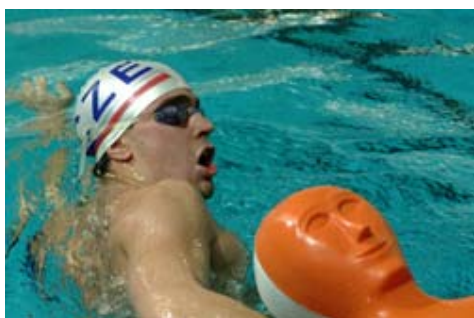
4x25m MANIKIN RELAY

Four competitors in turn carry a manikin approximately 25 m each.