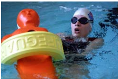
100 m MANIKIN TOW WITH FINS

The competitor swims 50 m freestyle with fins and rescue tube. After touching the turning edge, the competitor fixes the rescue tube around a manikin floating at the surface at the edge and tows it to the finish.