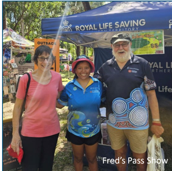
Fred's Pass Show

May was a massive month as Dry season community events rolled out across the Top End. Keep reading for all the highlights including fun at Fred's Pass Show, the inaugural Jingili Water Garden's Water Festival and a community visit to Nhulunbuy.