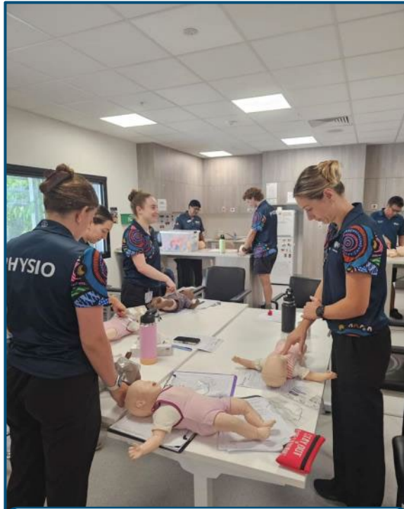
Hydrotherapy Rescue at Palmerston Regional Hospital on 8 May

We loved seeing such a strong turnout and passion for water safety.