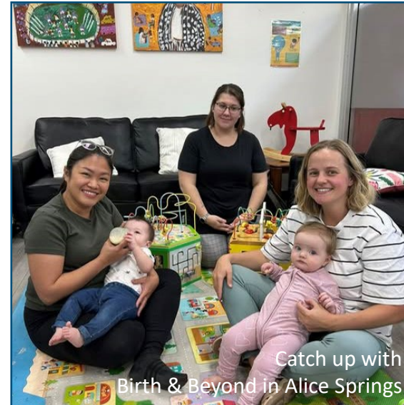
Catch up with Birth & Beyond in Alice Springs