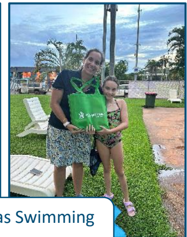
Catching up with the Nhulunbuy Barras Swimming Club