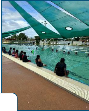
Bronze Medallion & Pool Lifesaving