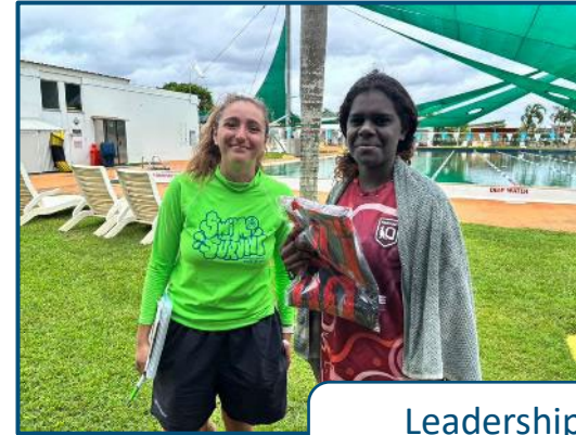
Leadership & participation winners