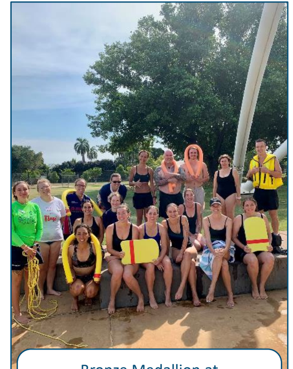
Bronze Medallion at Parap Pool on 17 May