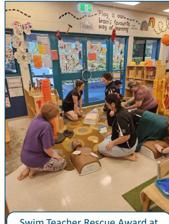
Swim Teacher Rescue Award at Bakewell Primary School on 14 May