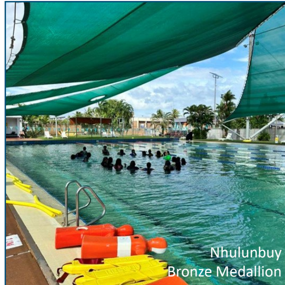
Nhulunbuy Bronze Medallion